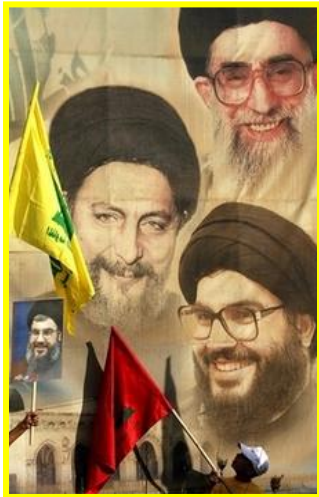
Hezbollah leader Hasan Nasrallah with Iranian Shiite religious leaders Khamenei and Sader