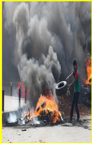
Members of Hezbollah burning tires and blocking streets in Beirut, during Hezbollah/AMAL attack.