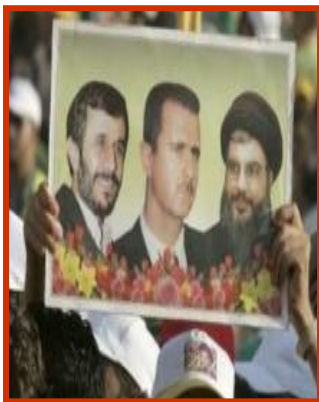
Hezbollah leader Hasan Nasrallah with Syrian president Bashar Assad and Iranian President Ahmadinejad