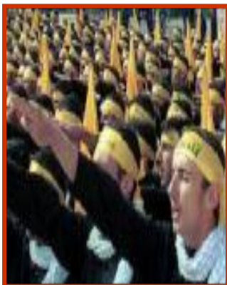
Members of Hezbollah fighters during Ashura parade in Beirut, Lebanon. They look very similar of the Pasdaran militia of Iran.

Hezbollah. What's is more disturbing is that Nasrallah's statement includes quotes from the Israeli Prime Minister Ehud Olmert telling his cabinet that "the balance [of power] in the region is now destabilized," calling for a peace "settlement with the Palestinians." Does Nasrallah truly believe that Israel is going to throw its hands up in the air and surrender because the balance of power is upset? No; Mr. Nasrallah. During similar cases in the past, Israel did not surrender, but it rather went to war against its enemies to regain its upper hand in the region. This is by no means to be viewed as a support to Israel, but it is rather to warn against another miscalculation by Nasrallah and a call to be more rational and realist when dealing with war and peace decisions for we fear that another of his blunders may destroy Lebanon and devastate its people who have not recovered from Nasrallah's last miscalculated war in 2006. Besides, what if Israel launches another war against Lebanon; will Nasrallah rebuild the country's infrastructure and revive the innocent martyrs? Or will he just claim another "victory," and excuse himself by stating, "I didn't know" any better, again? There has to be a higher degree of rationality, responsibility, and accountability or similar deadly mistakes will reoccur. It is the responsibility of the Lebanese government to take back the decision of peace and war.