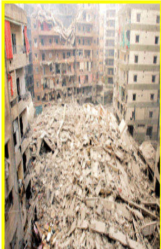
The destruction of Hezbollah's headquarters in the Southern Suburb of Beirut during the July war of 2006 with Israel.